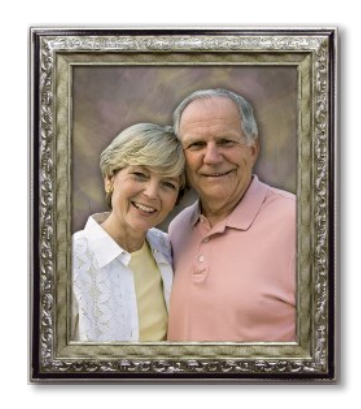
16" x 20" Canvas Portrait