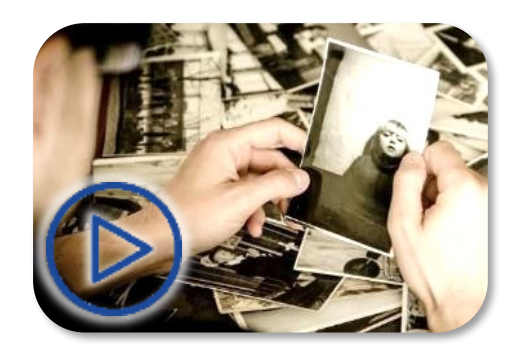
Video Life Tribute