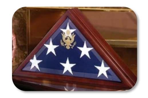
Veteran Flag Case